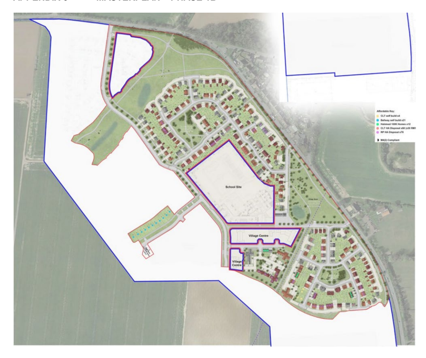
APPENDIX 3 - MASTERPLAN – PHASE 1B