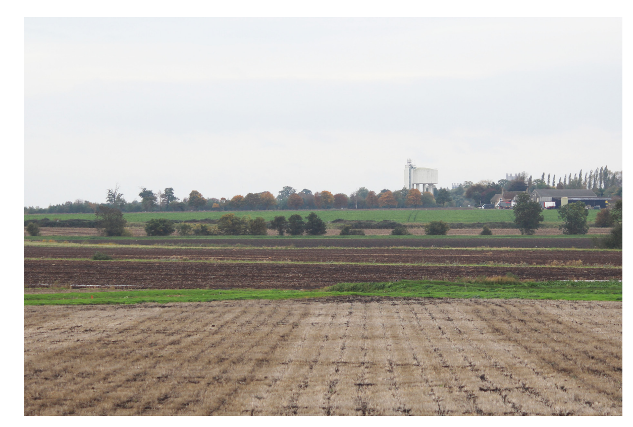
VIEW FROM KETTLESWORTH DROVE existing