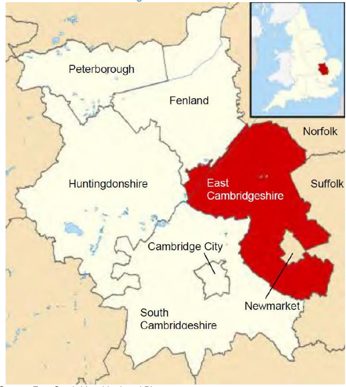
Figure 1 – The District of East Cambridgeshire

1.8 East Cambridgeshire is a predominantly rural district located to the north-east of Cambridge. The district covers an area of 65,172 ha, and has a population of 88,060 (mid-2018 estimates, Cambridgeshire County Council (CCC)). The district contains the city of Ely, two market towns, and 50 other villages and hamlets varying in size, including the fringe areas of Newmarket.